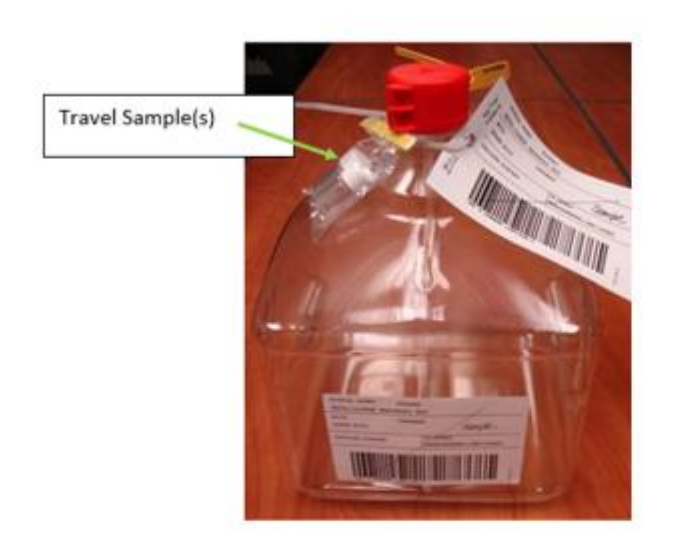
Empty container with attached travel sample vials