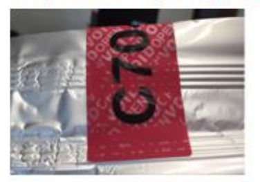
Tamper evidence sticker that has been broken