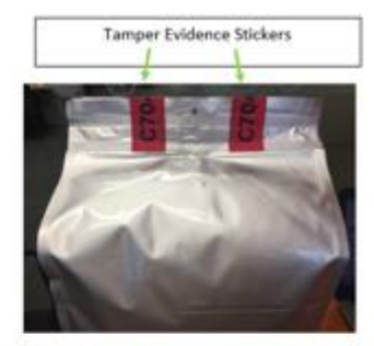
Biologic DS container in aluminium seal pouch with tamper evidence sticker with unique numbering for shipping