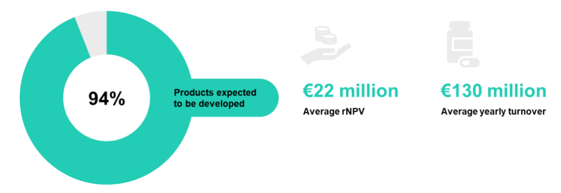
Figure 1. The current economic picture for orphan medicines in Europe

While according to economic theory a positive rNPV would support investment, in practice developers are looking for rNPVs significantly greater than zero. In this context, a rNPV of €22 million is very marginal. As in our 2020 report, we attribute continued innovation in the rare disease space despite limited incentives to optimism from developers and a de facto subsidisation of global orphan innovation by the US market.