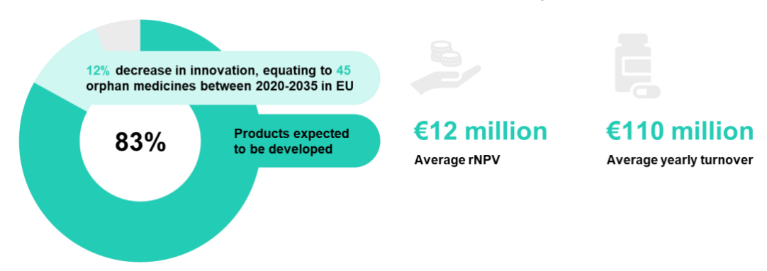
Figure 2. Impact on orphan innovation in Europe given changes proposed by the Commission

Our first scenario was geared to represent the changes proposed by the Commission. It shows that shortening OME and introducing a 7-year validity for the orphan designation would decrease innovation expected based on European incentives by 12%. Building on the Commission's estimate that 375 orphan medicines would be approved over the next 15 years<sup>12</sup>, this translates to a loss of 45 orphan medicines between 2020-2035 − which could deprive about 1.5 million European rare disease patients of a novel treatment option, and the continent of about €4.5 billion in R&D spending.